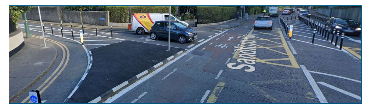
Figure 1-1 - Street View of Junction of Belmont Avenue and Sandford Road

The interim scheme was implemented in the weekend of 19<sup>th</sup> to 21<sup>st</sup> of August 2022 in advance of the school reopening period of September. This is essentially included the provision of a temporary traffic island and delineation devise and signage to direct traffic and prevent vehicles entering Belmont Avenue from Sandford Road.